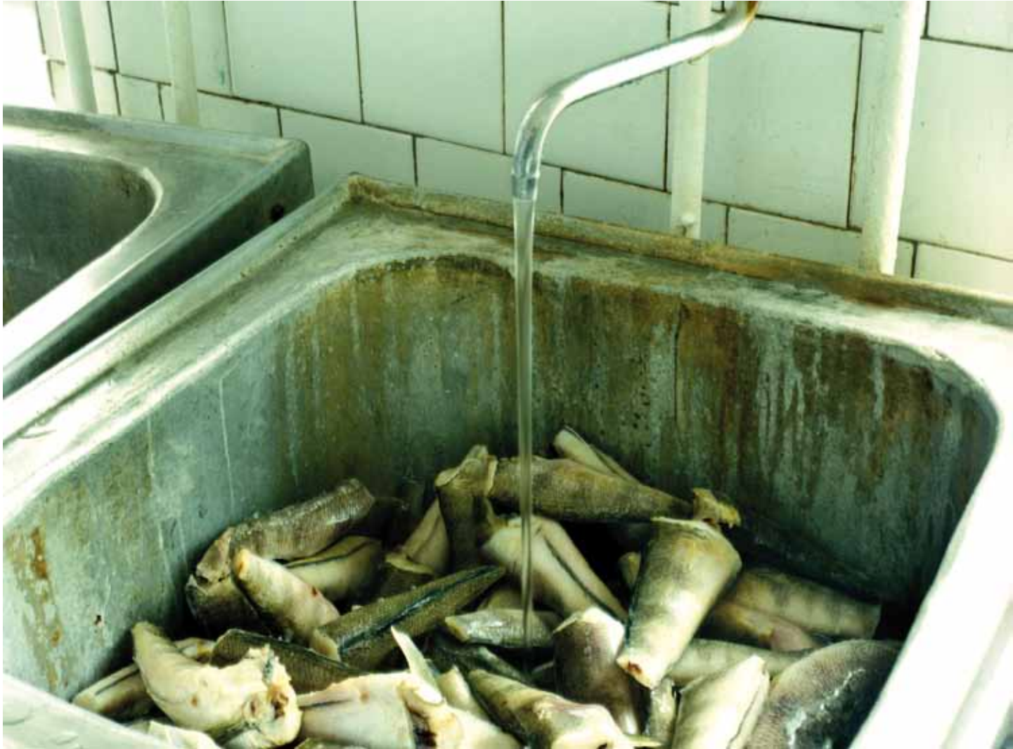
Dinner time § 2009