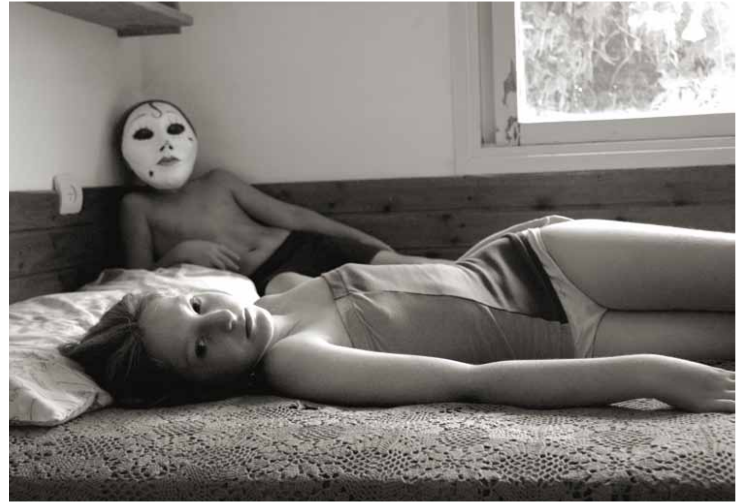
The mask § 2007