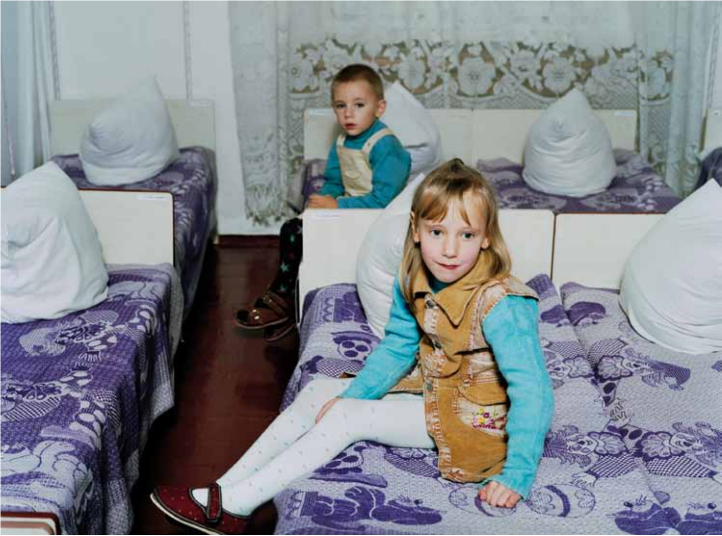
Purple Clown § 2008