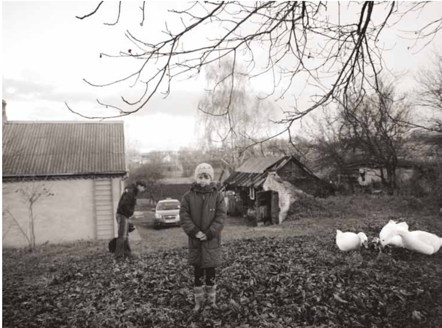
Fall § 2008