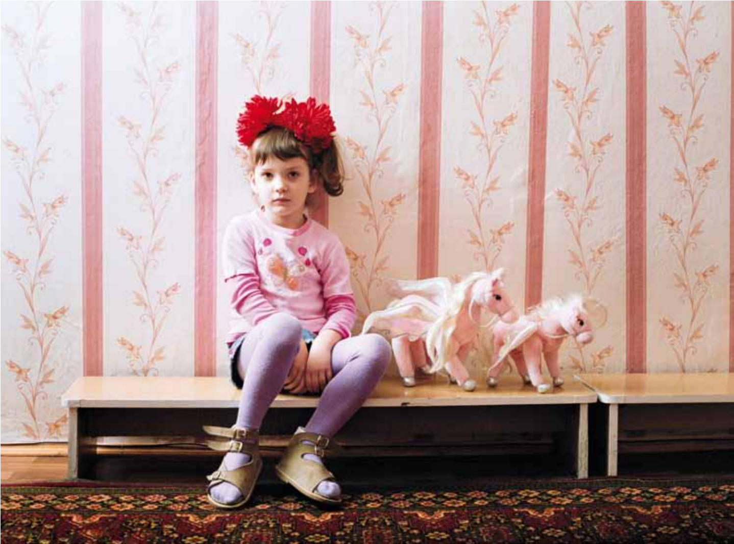
Horses § 2009