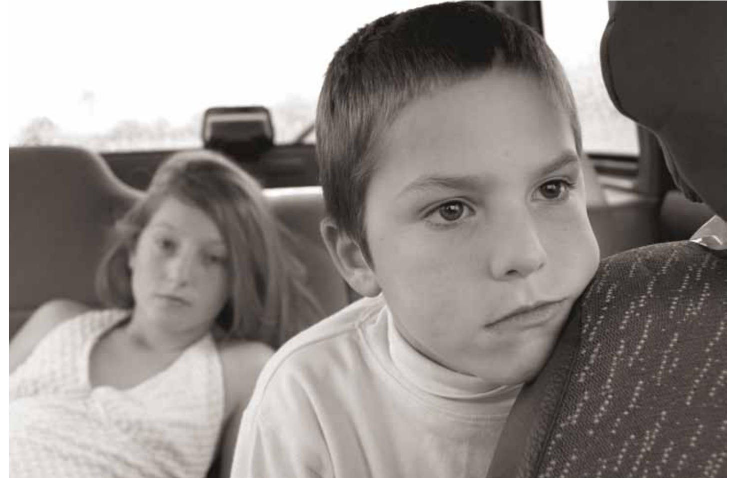
Waiting for the light § 2007