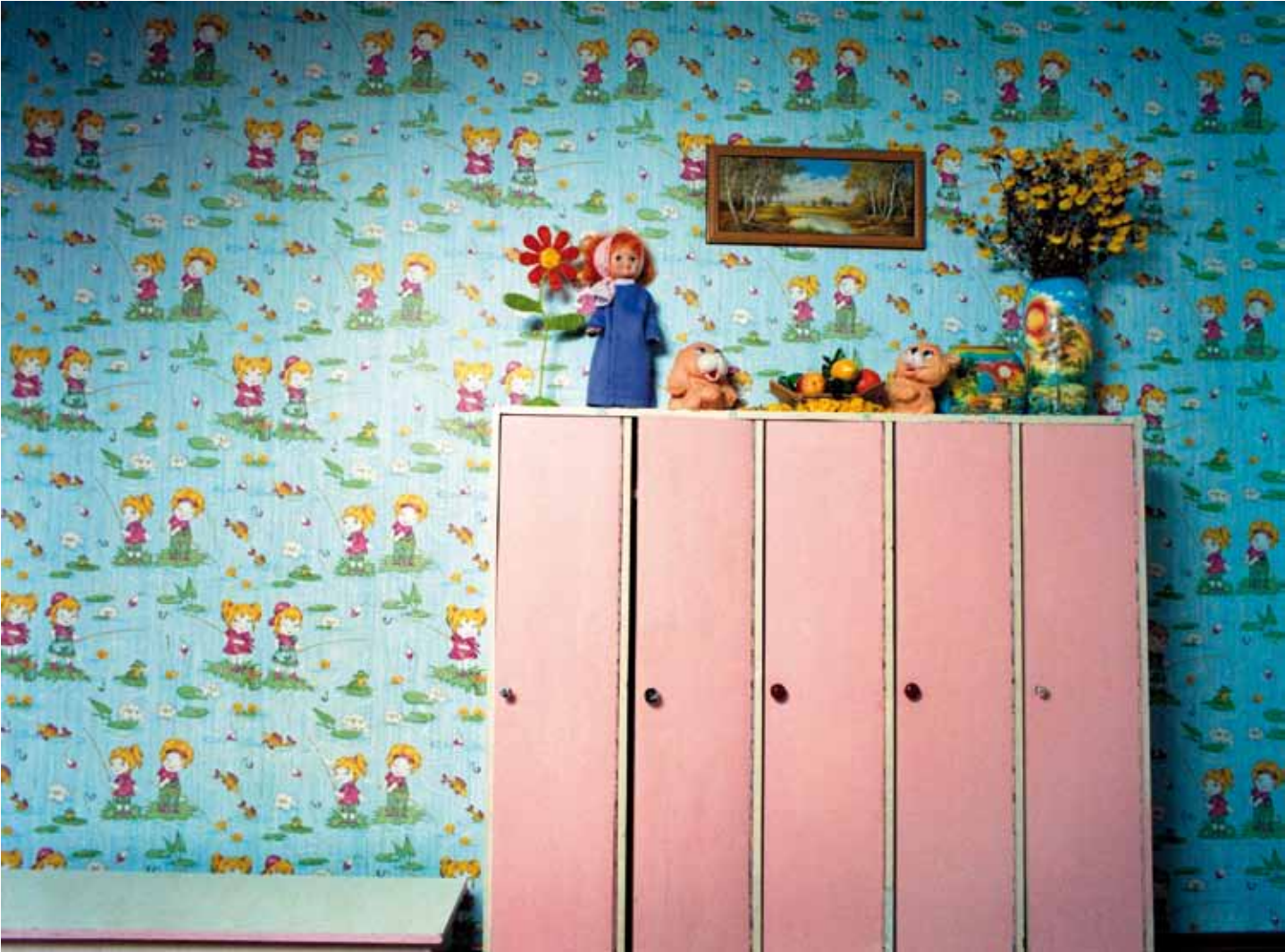
Lockers § 2008