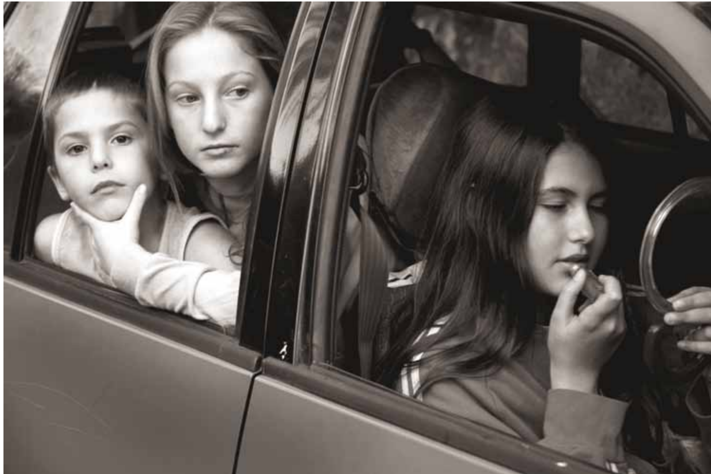
Untitled § 2007