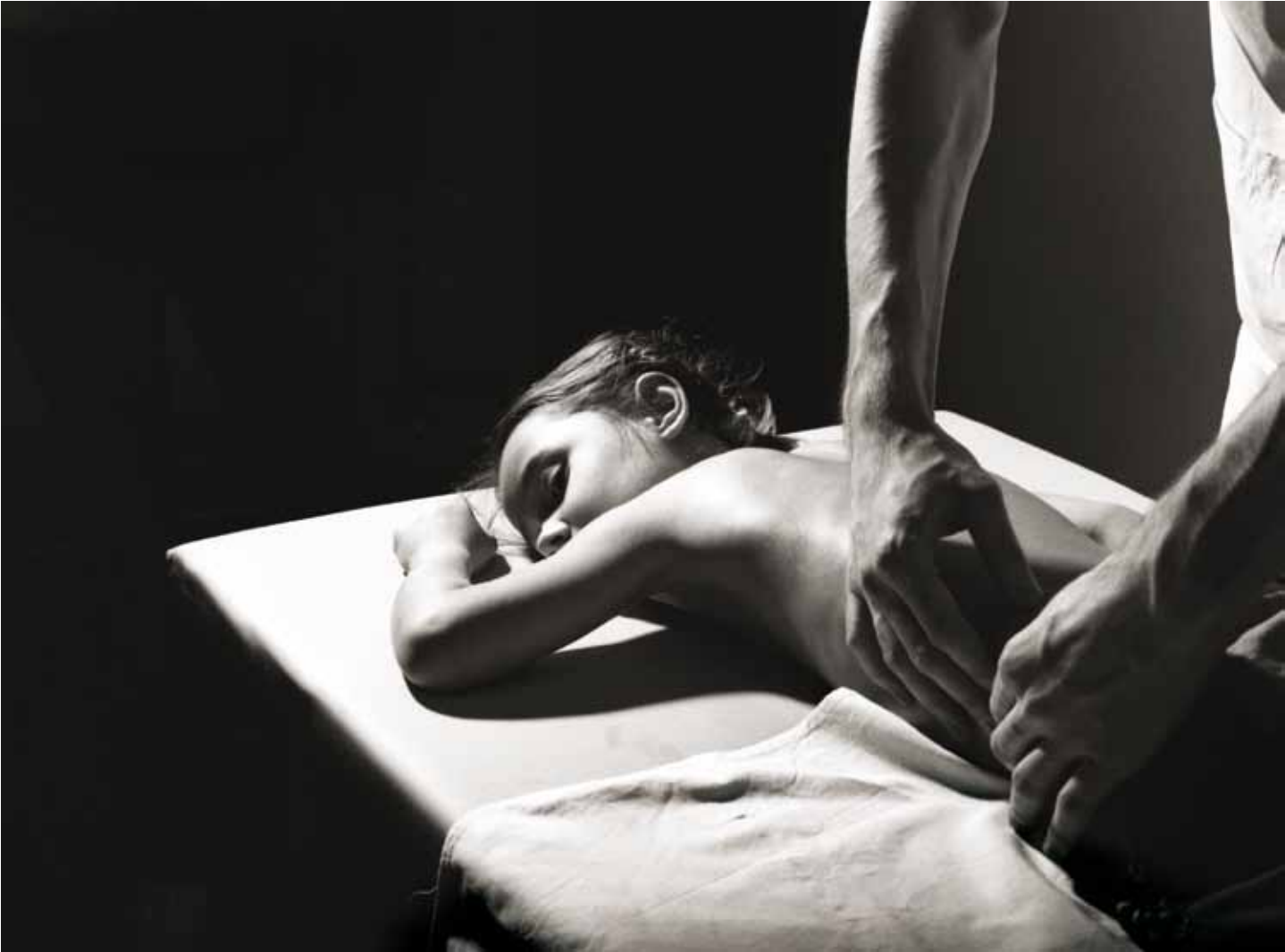
Anyu § 2008