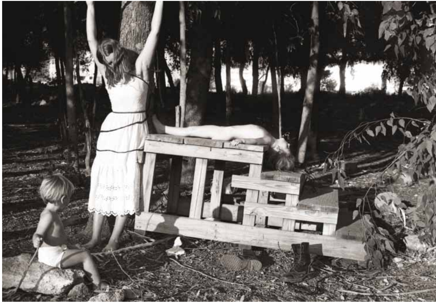
Altar § 1998