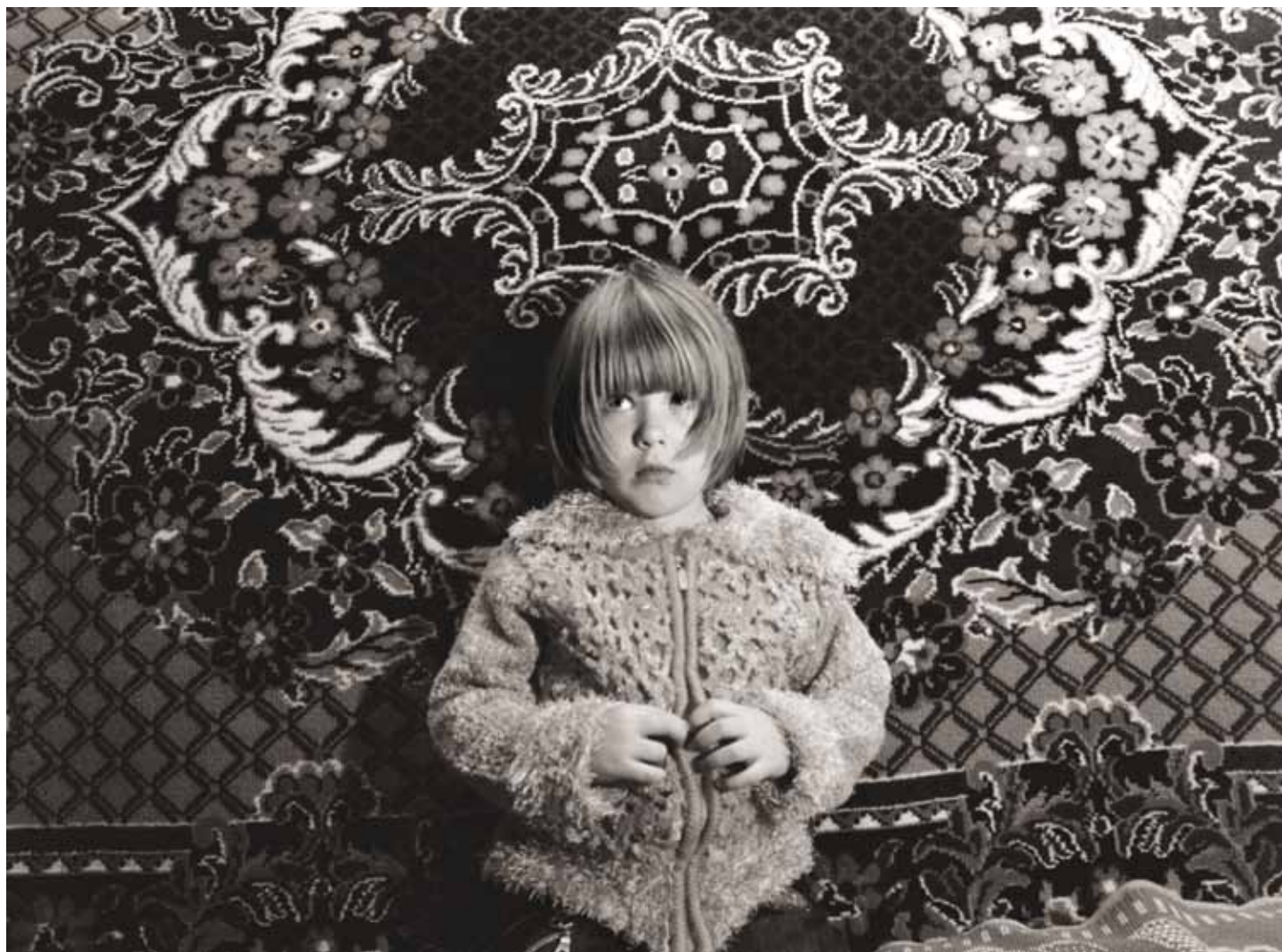
Untitled § 2008