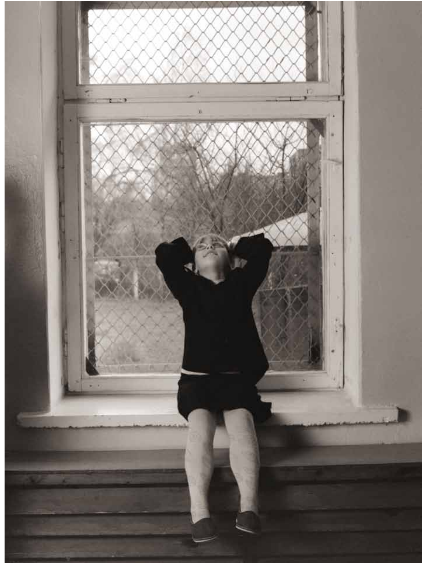
The big window § 2008 >