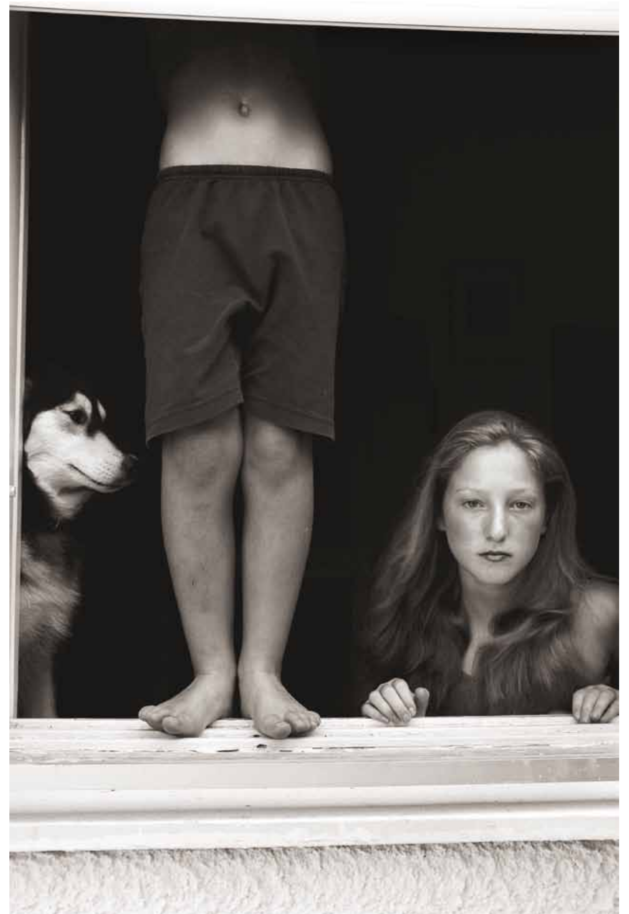
Untitled § 2007 >