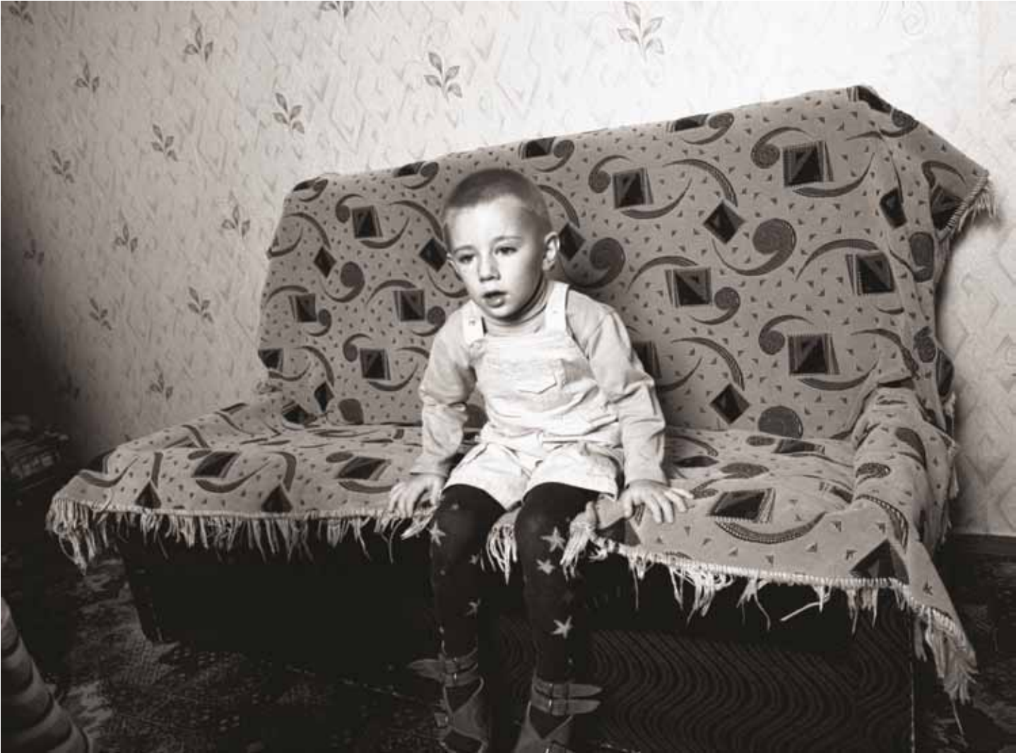
Maxim § 2008