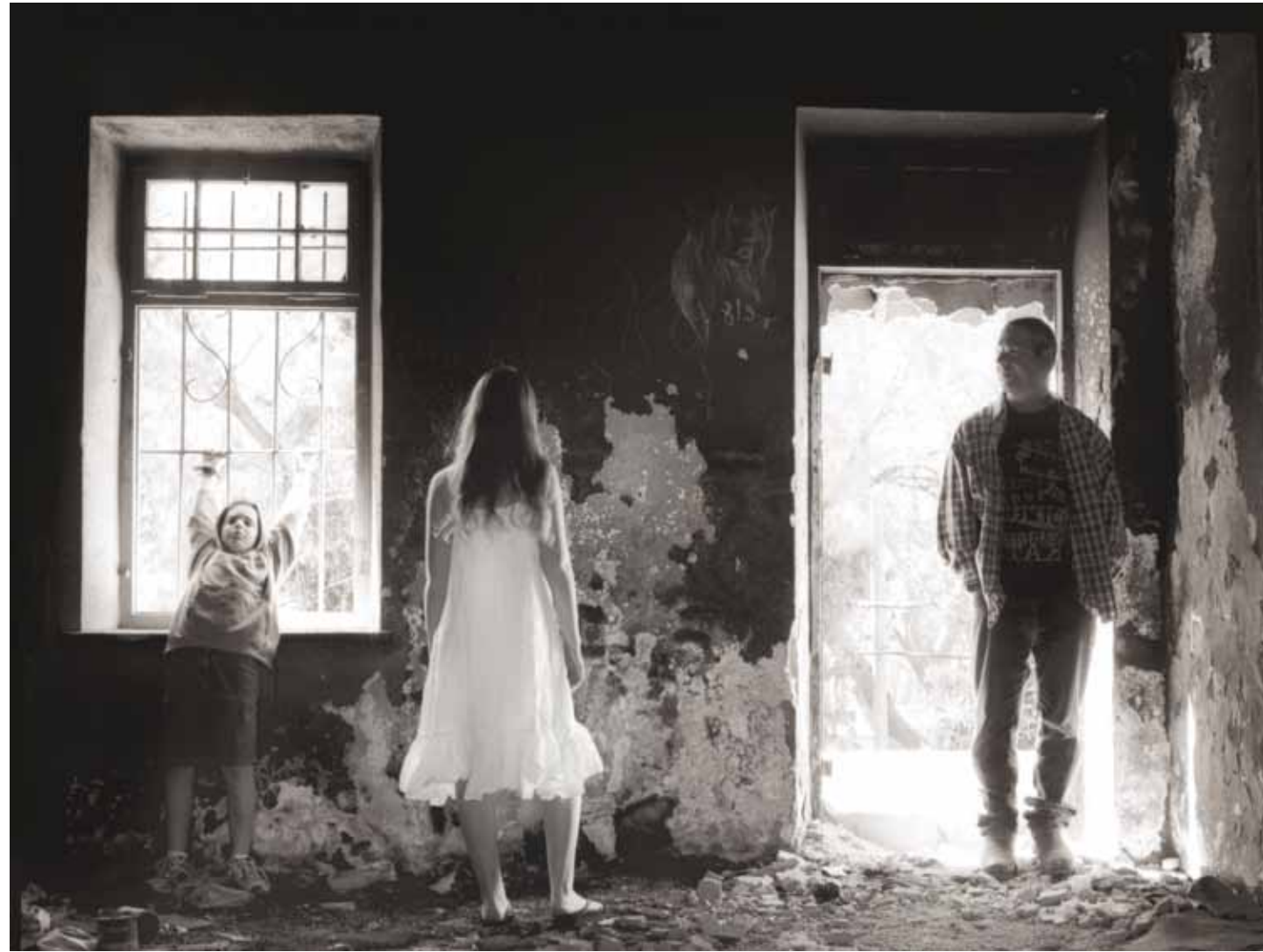
Dad and the kids § 2008